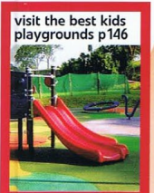
visit the best kids playgrounds p146