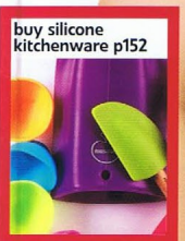
buy silicone kitchenware p152

40 CAUSES YOU CAN HELP TODAY. PLUS, WOMEN WHO MAKE DOING GOOD AN ART