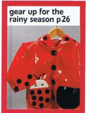
gear up for the rainy season p26

SECRET SHOPPING SPOTS Find pre-loved things from fashion to furniture